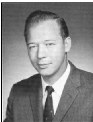
Freshman year in college - 1959